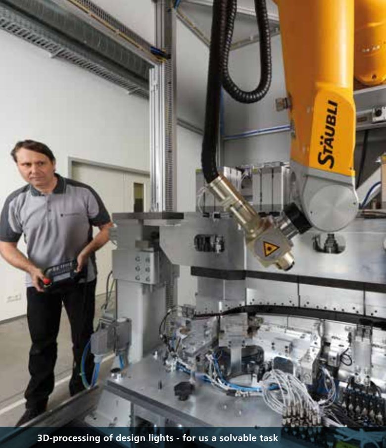
3D-processing of design lights - for us a solvable task